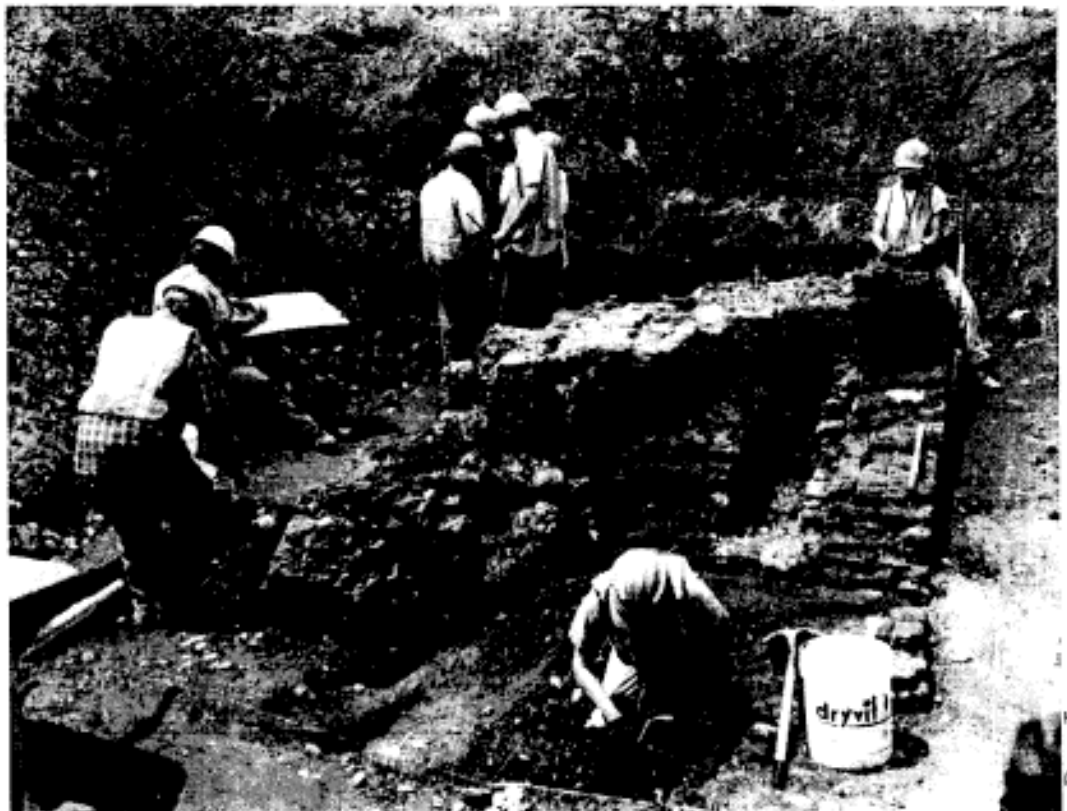
Archaeologists from Hunter Research excavating and recording the Richards stoneware kiln.