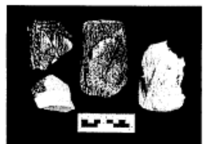
Fig. 3. Tree bark creamer.