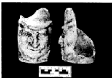
Fig. 1 Toby mug marked PAT APLD FOR.