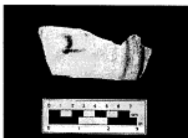
Fig. 2 Sherd with hand-painted number