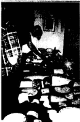
Visitors examine the display of ceramic artifacts recovered during archaeological excavation in Trenton.